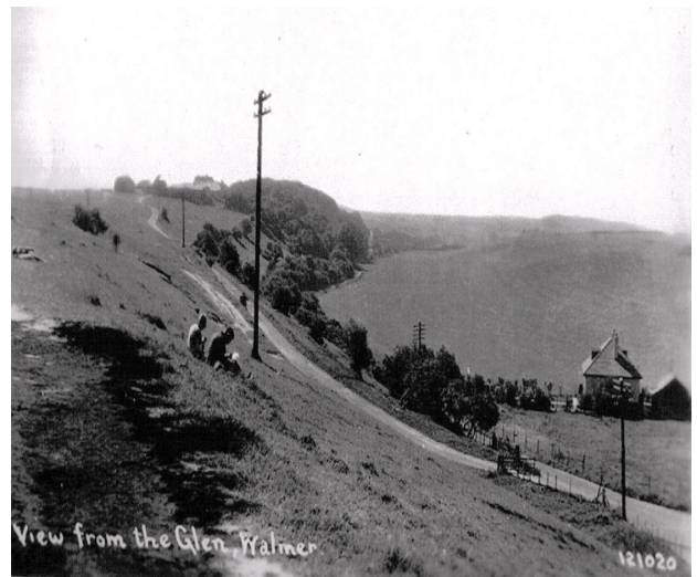
View of Hawkshill looking South towards Kingsdown in 1906

Green Gang is a special programme of activities organised for children and their families during the school holidays. These activities have been funded by Pfizer in conjunction with Walmer Parish Council