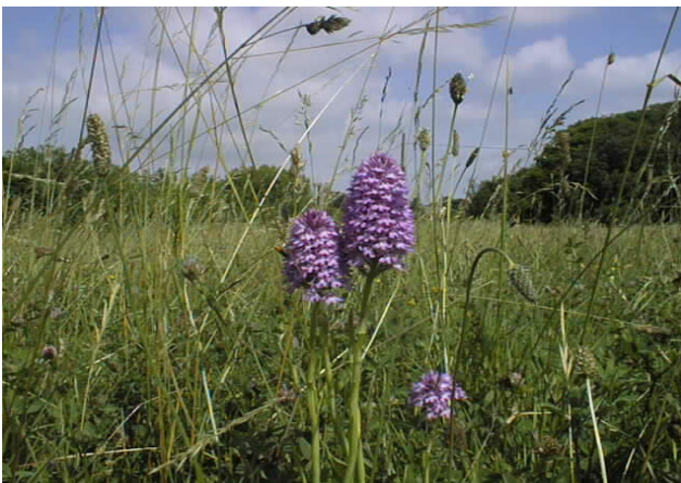
Pyramidal Orchids on Hawkshill Freedown

In addition to the vast improvements made to the Memorial, the Hawkshill Working Group arranged for the Electricity Board to erect fencing around the electricity sub station. The group also worked with Kent County Council to provide a much improved surface to the main footpath which leads from the car parking area on Liverpool Road up to the main grass plateau.