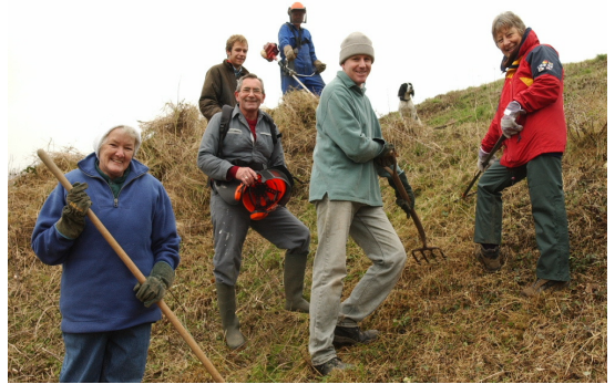
Members of the group working on the chalk bank.

More volunteers are needed to help conserve Hawkshill Common and clear the scrub which is invading this important piece of chalk grassland.