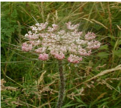
Wild Carrot plant

✦ On the newly cleared slope 24 different species were identified. This is clearly an area in transition with patches of bare ground still visible, and higher numbers of species not associated with chalk grassland such as Prickly Hawkbeard, Cleavers and Ivy. However, the most commonly occurring plant was our native herb Marjoram .